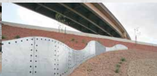
BRIDGE AND HIGHWAY