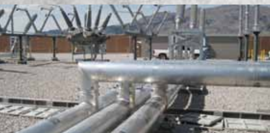
POWER TRANSMISSION AND DISTRIBUTION