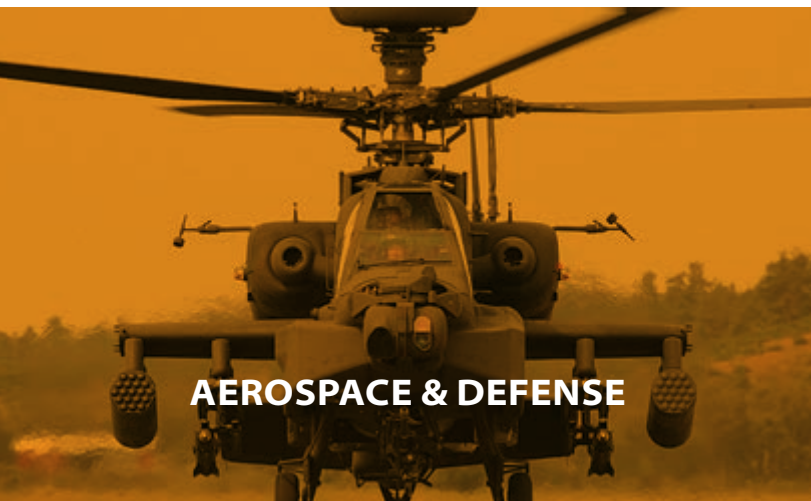
AEROSPACE & DEFENSE