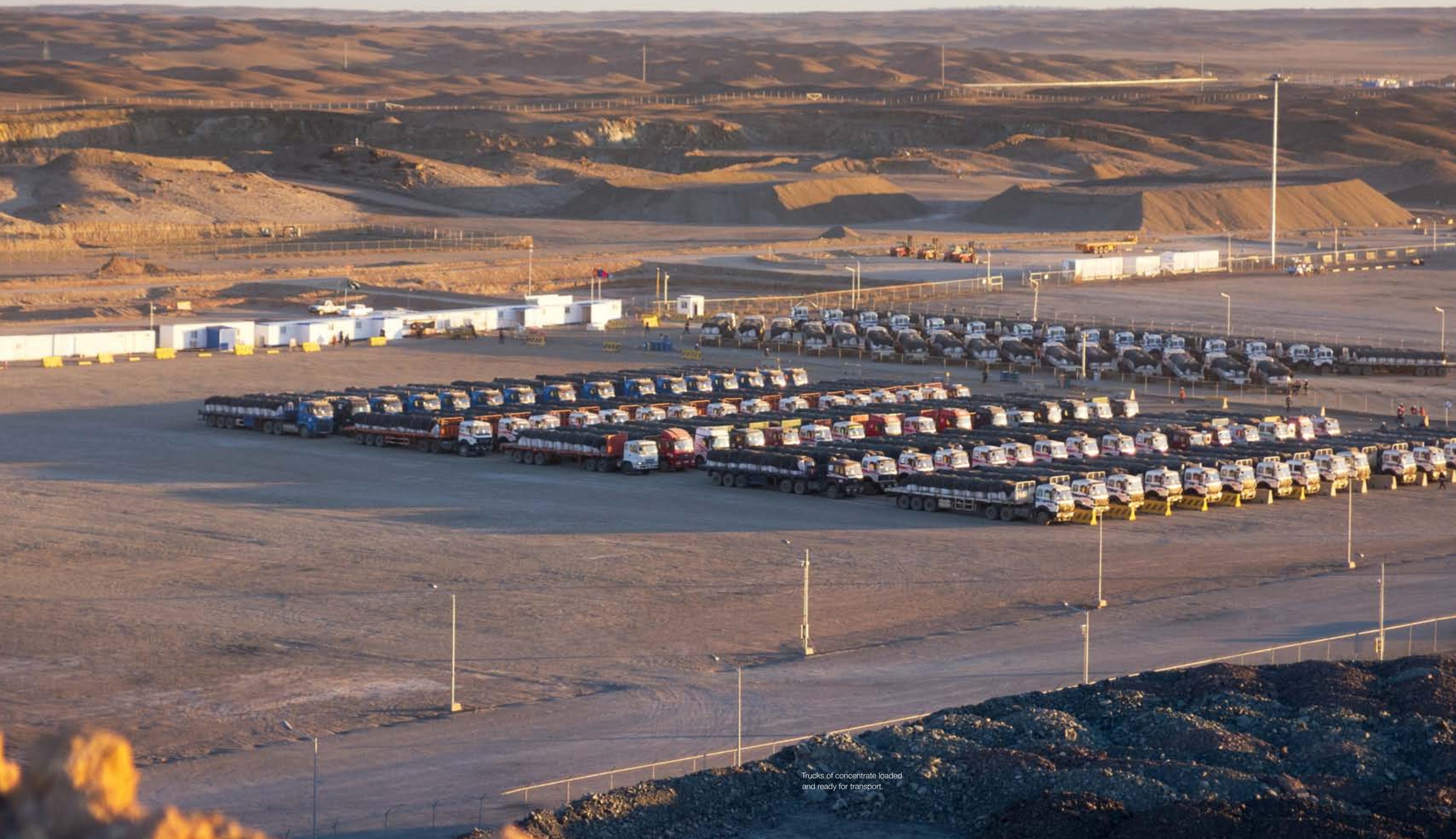
Trucks of concentrate loaded and ready for transport.