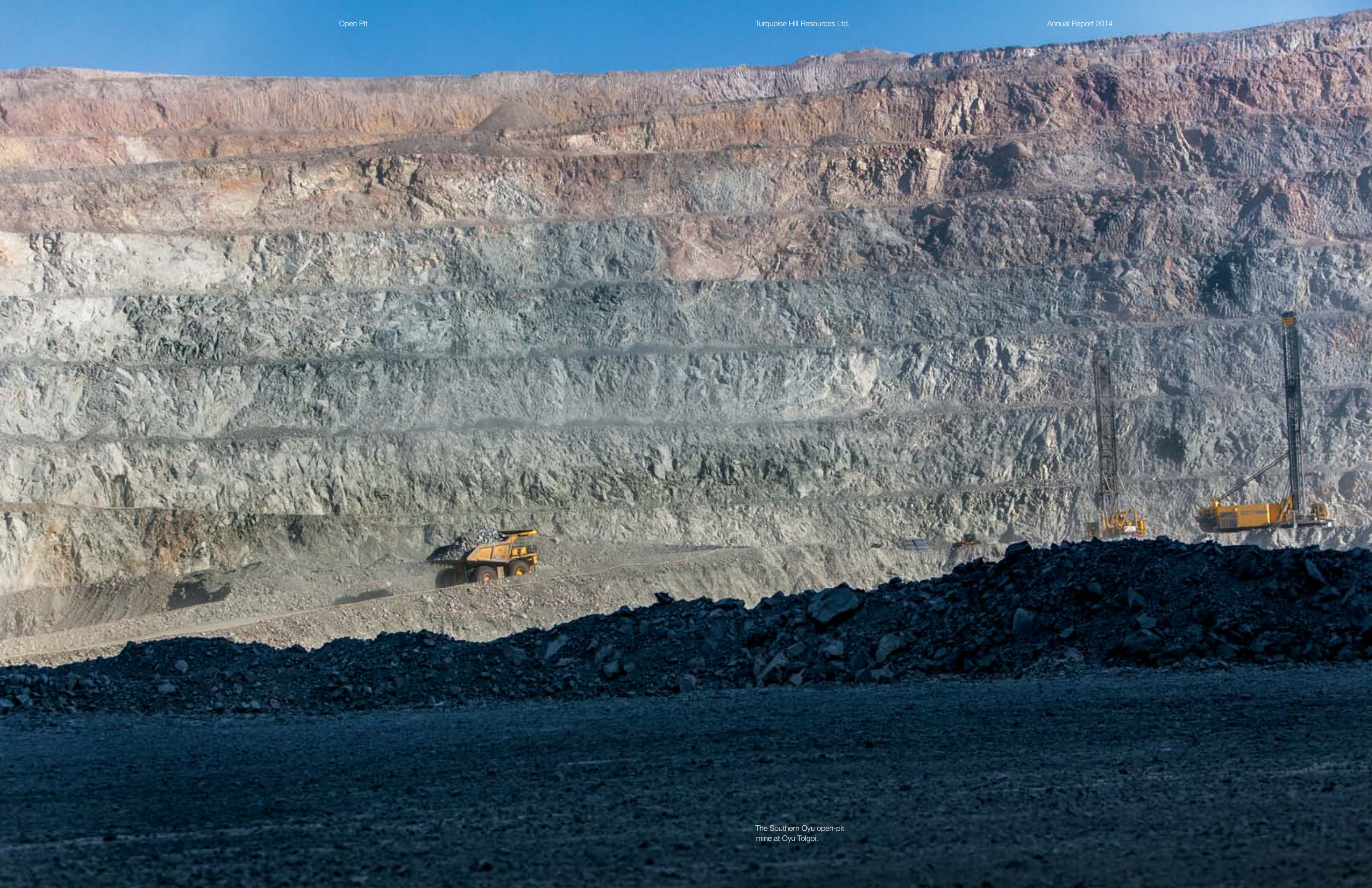
The Southern Oyu open-pit mine at Oyu Tolgoi.