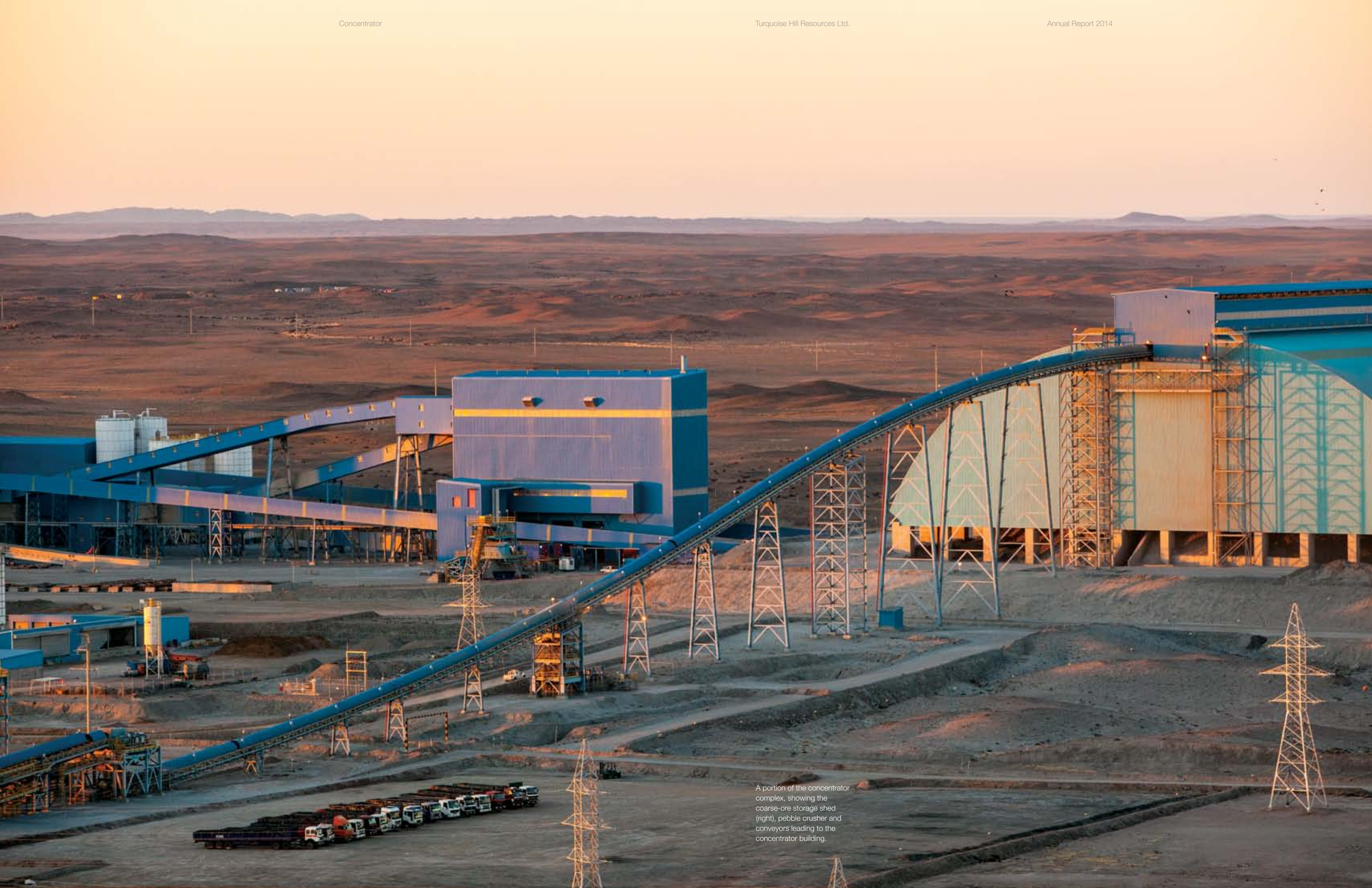
A portion of the concentrator complex, showing the coarse-ore storage shed (right), pebble crusher and conveyors leading to the concentrator building.