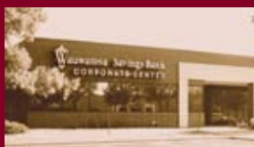
Corporate Center, Wauwatosa