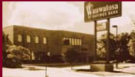
Oak Creek Office