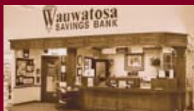
Pewaukee In-Store Office