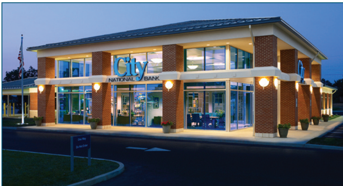
The exterior of our King Street office in Martinsburg.