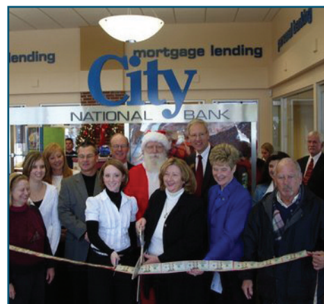
Employees celebrating the opening of the new office in Princeton in December 2007

To emphasize its commitment to providing the best service and products to its customers, the Company recently converted its core operating systems – a major initiative that was a critical area of importance for the Company's operations during most of 2007. This integration was successfully completed in February of 2008, laying the groundwork for City to support more customers with better products and services in the years ahead.