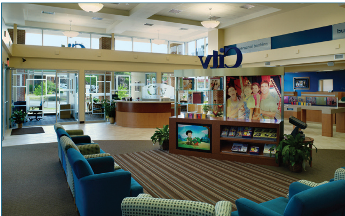
The spacious, flowing interior of our King Street banking center that opened in July 2007

Despite the difficult economic conditions it faced in 2007, City Holding Company had a solid year, and its earnings per diluted share rose from $2.99 in 2006 to $3.01 in 2007. Due to the strong and sustained earnings, the Company has announced an increase in its dividend to $1.36 per share on an annualized basis beginning with the April 2008 payment. This represents an annualized growth in dividends of 11.5% between 2004 and 2008. With a dividend payout ratio in 2007 of approximately 41%, and a tangible equity ratio of 9.72% as of December 31, 2007, the Company is optimistic that it will be able to continue to reward shareholders with increased dividends in forthcoming years.