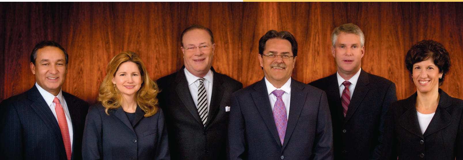
CSX Executive Team