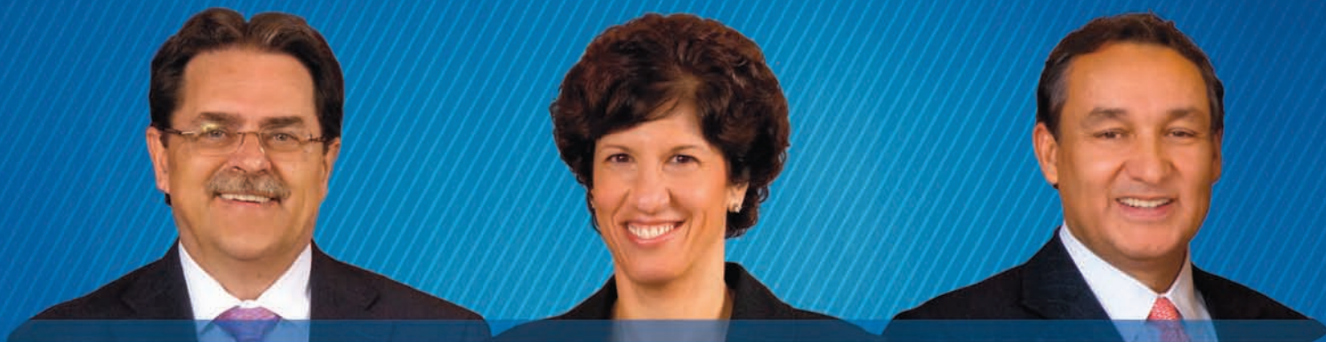
CSX Executive Team