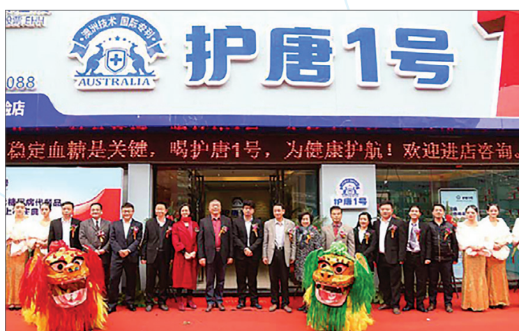
The opening ceremony for Eagle Health's Education and Experience store in Xiamen, China

In September 2018 Eagle Health announced its application for registration of the product formula, including the company's high-speed line, with the China Food & Drug Administration (CFDA) as a Food for Special Medical Purposes (FSMP). The process is expected to be completed by the December 2019 quarter.