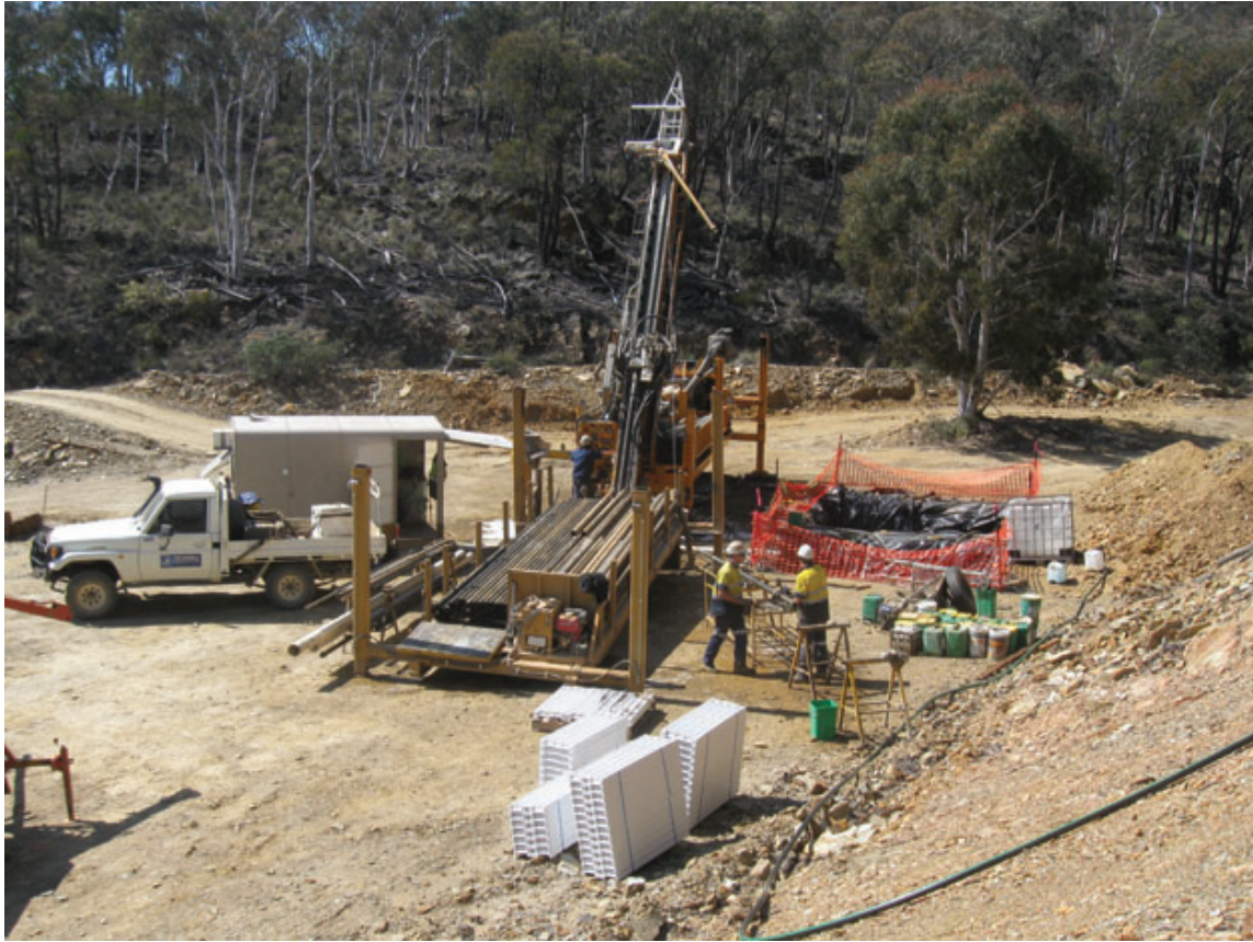
Commissioners Gold "Cowarra" drilling, September 2011