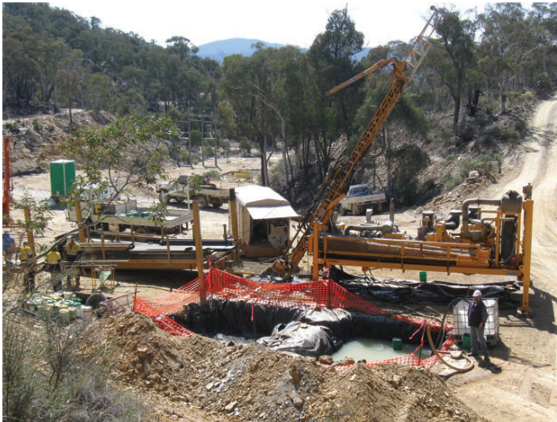
Commissioners Gold "Cowarra" drilling, September 2011