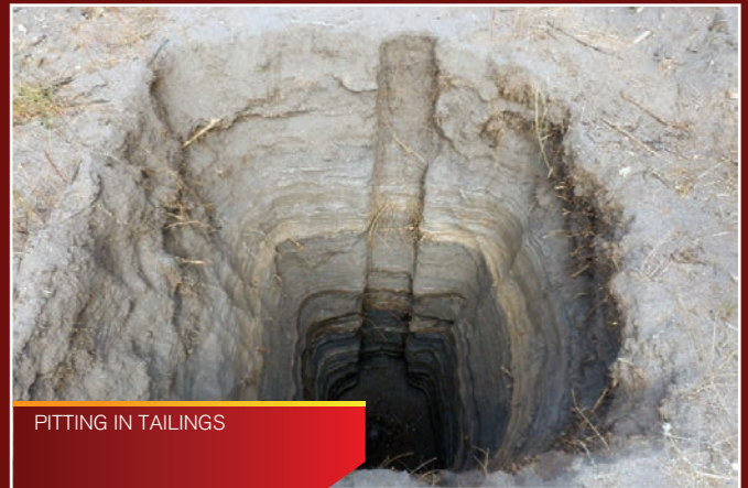
PITTING IN TAILINGS