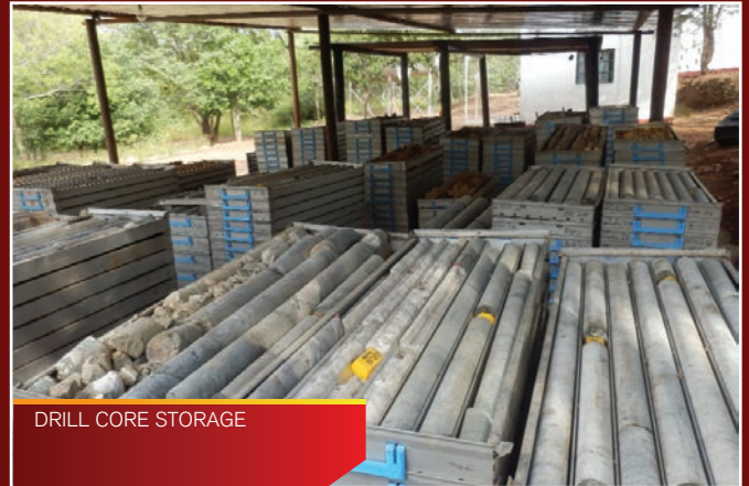
DRILL CORE STORAGE

of remuneration. The Committee will make recommendations to the Board, within agreed terms of reference, regarding the levels of remuneration and benefits including participation in the Company's share plan.