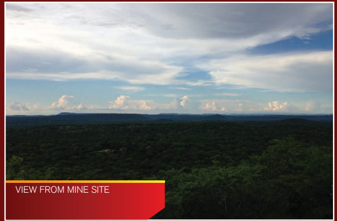
VIEW FROM MINE SITE