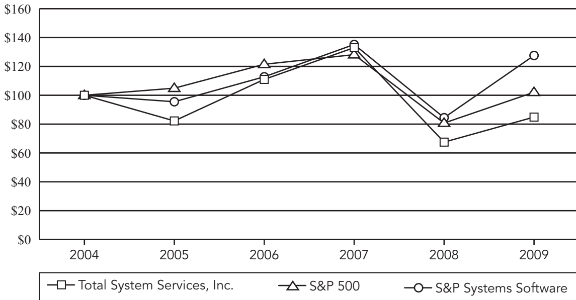
COMPARISON OF FIVE YEAR CUMULATIVE TOTAL RETURN AMONG TSYS, THE S&P 500 INDEX AND THE S&P SYSTEMS SOFTWARE INDEX

The following graph compares the yearly percentage change in cumulative shareholder return on TSYS stock with the cumulative total return of the Standard & Poor's 500 Index and the Standard & Poor's Systems Software Index for the last five fiscal years (assuming a $100 investment on December 31, 2004 and reinvestment of all dividends).